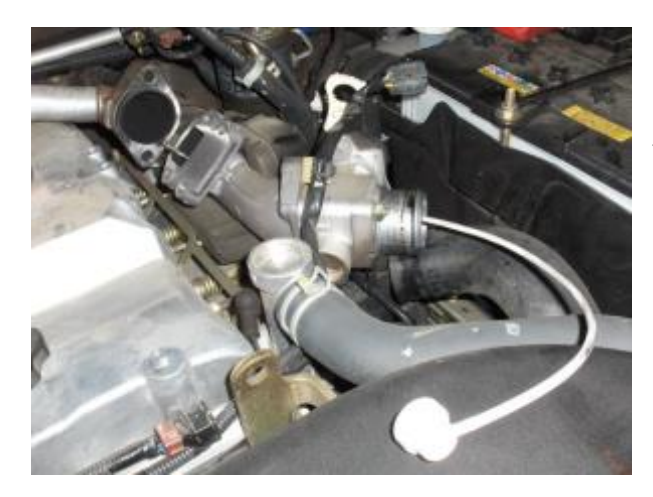
C2. If the valve is at remote distance to the injection point of the product, use an extension tube (available in option) to get closer to the valve, then act the same way as in A.